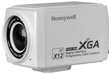
Built-in Optical Zoom Lens

850K Pixel, 12x Zoom, Built-in MIC, A/V Digital Out, 15fps