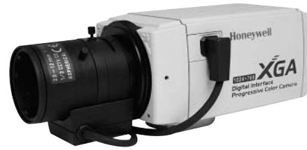
2.8~12mm lens supplied with camera

850K Pixel, Built-in MIC, A/V Digital Out, 15fps